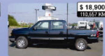
2007 CHEVROLET SILVERADO 1500 4x4 Crew Cab