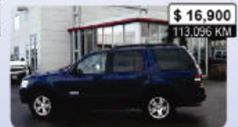
2008 FORD EXPLORER XLT 4x4