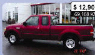
2008 FORD RANGER Ext. Cab 4x2