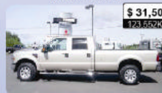
2008 FORD F-350 Diesel 4x4 Crew Cab 8' Box