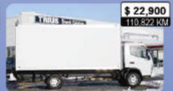
2007 MITSUBISHI FUSO FE140 CW 16' Cube Body & Ramp