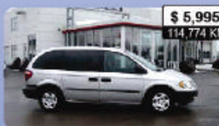
2002 Dodge Caravan SE - 7 Passenger