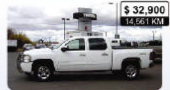
2009 CHEVROLET SILVERADO 1500 4x4 HYBRID Crew Cab

Check out our online showroom for our complete inventory.