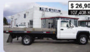
2006 Chevrolet 3500 Cab-Chassis 4x4 CW 12' Flatbed