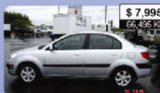
2008 KIA RIO