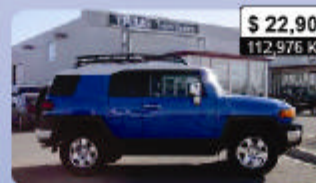
2007 Toyota FJ Cruiser 4x4