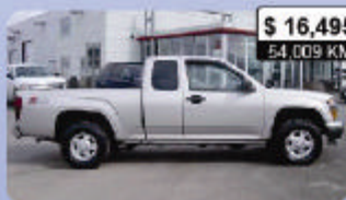
2007 Chevrolet Colorado Ext. Cab 4x4 Z-71