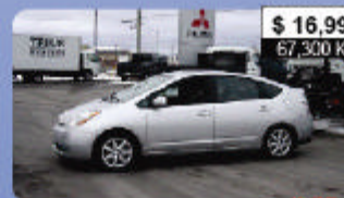
2008 TOYOTA PRIUS HYBRID