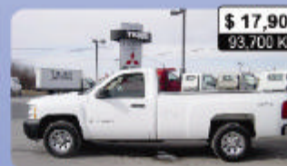
2007 CHEVROLET SILVERADO 1500 4x4