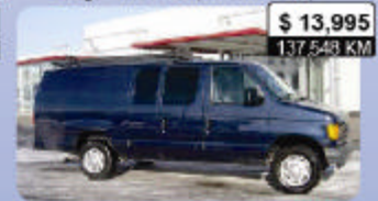
2005 FORD E-250 Extended Cargo Van