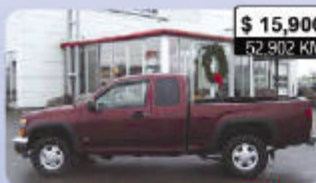
2007 CHEVROLET COLORADO Ext. Cab 4x4