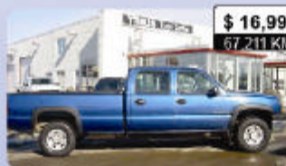
2004 Chevrolet SILVERADO 2500HD 4x2 Crew Cab 8' Box