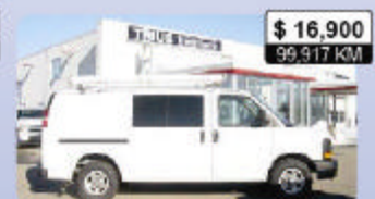
2007 Ford E-Series Cargo Van E-150 (Two Available)